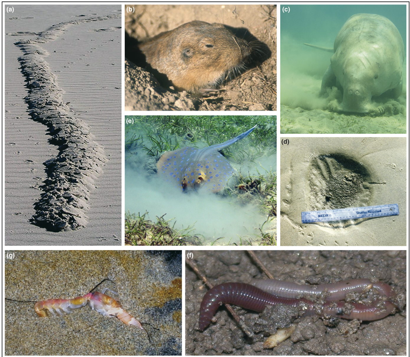
Figure 1. Bioturbation results from a range of animal activities. The most eye-catching are those created by larger subterranean mammals [13], such as insectivorous moles [(a) mole track at Noordhoek beach, Cape Town] and herbivorous pocket gophers Thomomys talpoides macrotis (b) in prairie grasslands. In the marine environment, large-scale burrowing is also present, but less easily detectable [7]. Side-scan sonar has revealed conspicuous trenches (4-m long, by 2-m wide, by 0.4-m deep) created by grey whales in search of benthic amphipods, and long linear traces (0.4-m deep by 50-m long) generated by walrus ploughing the surface sediment in search for bivalves. In seagrass meadows, similar-sized pits and trails are created by herbivores, such as geese and dugong Dugong dugong (c) feeding on rhizomes. On tidal flats, smaller feeding pits (d) (up to 1-m wide and 30-cm deep) are attributed to stingrays such as the blue-spotted stingray Taeniura lymma (e). Small invertebrates have a small per capita impact, but are dominant from a global perspective because of their sheer abundance and ubiquity [7]; examples include ants, termites and the common earthworm Lumbricus terrestris (f). In the marine environment, the predominant bioturbators are deposit-feeding polychaetes and various burrowing crustaceans, such as burrowing shrimp [(g) geochemical gradients created in a laboratory observatory by the shrimp Neotrypaea californiensis ]. Reproduced with permission from Robb Tarr (a), Richard Reading (b), Dick van Oevelen (c,e), Anthony D'Andrea (d,g), Cynthia Simms Parr (f).

ocean floor via pellet production, track formation and different types of construction, such as mounds and pits [17]. This biologically induced roughness modifies the hydrodynamics above the sediment layer, which in turn affects erosion and resuspension [8]. In addition, active sediment transport could also operate, as suspension feeders capture food particles from the water column (biodeposition) or deposit feeders eject fluidised faecal pellets into the water column (bioresuspension) [18]. Even in coastal systems, which are traditionally seen as shaped only by the physical forces of currents and waves, hydraulic engineers have recently recognised